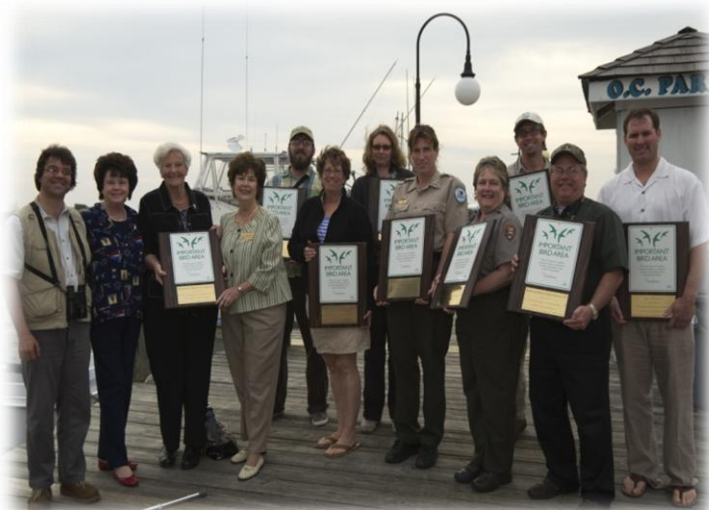
IBA dedication ceremony for Maryland Coastal Bays IBA and Assateague Island IBA.

• Partnered with the Wicomico Environmental Trust to defeat a proposed subdivision of 147 houses in the heart of Pocomoke-Nassawango IBA , home to 12 at-risk bird species.