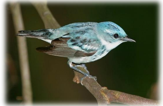
Cerulean Warbler is globally vulnerable due to extensive loss and fragmentation of forest habitat.

The Important Bird Areas (IBA) Program has had a very active and successful year with 6 new IBA sites identified, 108 Bird Blitz surveys completed to record at-risk bird species, and actions to promote habitat protection and conservation planning on Maryland's lower Eastern Shore and Southern Maryland.