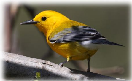
An estimated 111 pairs of the continentally vulnerable Prothonotary Warbler breed in the floodplain forest of Mattawoman Creek IBA.