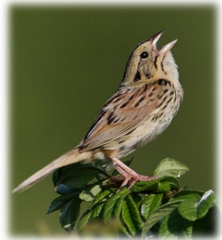
Henslow's Sparrow is listed as Threatened in Maryland. Bird Blitz found a globally significant population of 60 individuals in Allegany and Garrett Counties.

Bird Blitz data has resulted in 6 new IBAs in Maryland in 2009-2010. IBAs are identified by the Maryland-DC IBA Technical Review Committee comprised of Audubon staff, Maryland DNR biologists, and other bird experts.